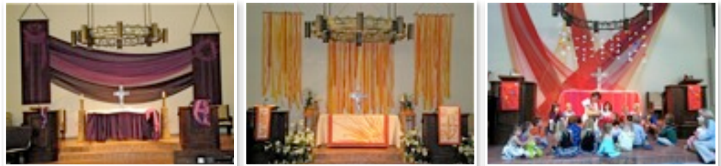
SDUMC's new paraments and wall hangings for three, of the seven, liturgical seasons. From left to right—Lent, Easter and Pentecost.

THE MISSION OF SAN DIEGUITO UNITED METHODIST CHURCH IS TO MINISTER to the hopes and hurts of a troubled world, NURTURE people in a community of grace, and INVITE all persons to new life in Jesus Christ.