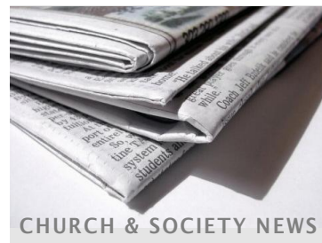
CHURCH & SOCIETY NEWS